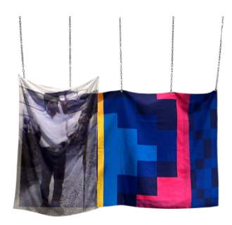
Iguana, 2024 Digital print on fabric and chains 55 \times 94 \times 15 inches $4,000