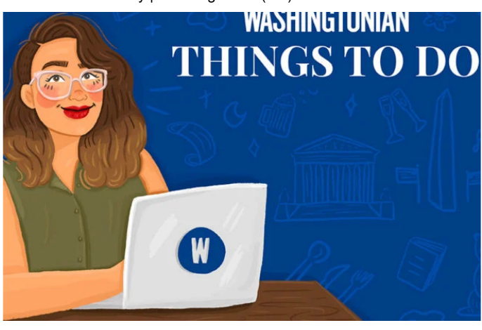
New Theater, Jazz, and a Beer-and-Pizza Fest: Things to Do in DC, February 25-28