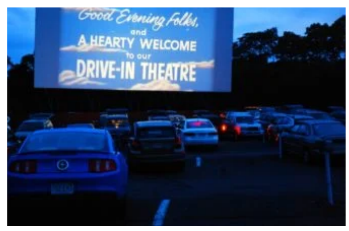
The Drive-In Movie Theater in Alexandria Is Starting Its Season This Friday