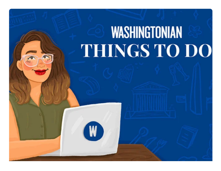
Modern Art, Yoga, and Drive-in Movies: Things to Do in DC, March 4-7