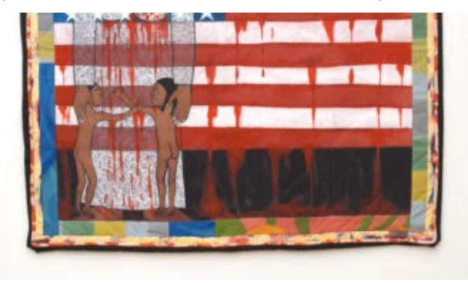
Glenstone Will Host Its First Touring Exhibit When It Reopens This Spring