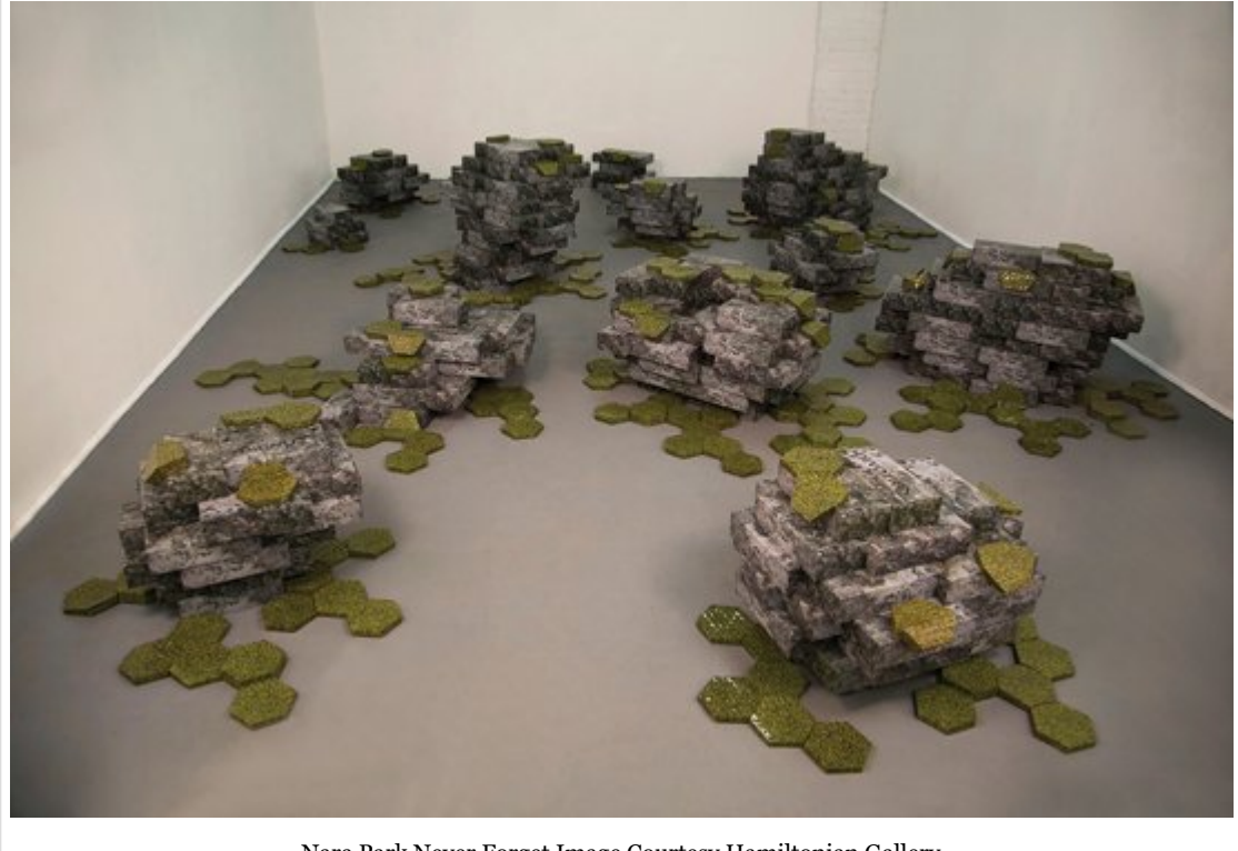
Nara Park Never Forget