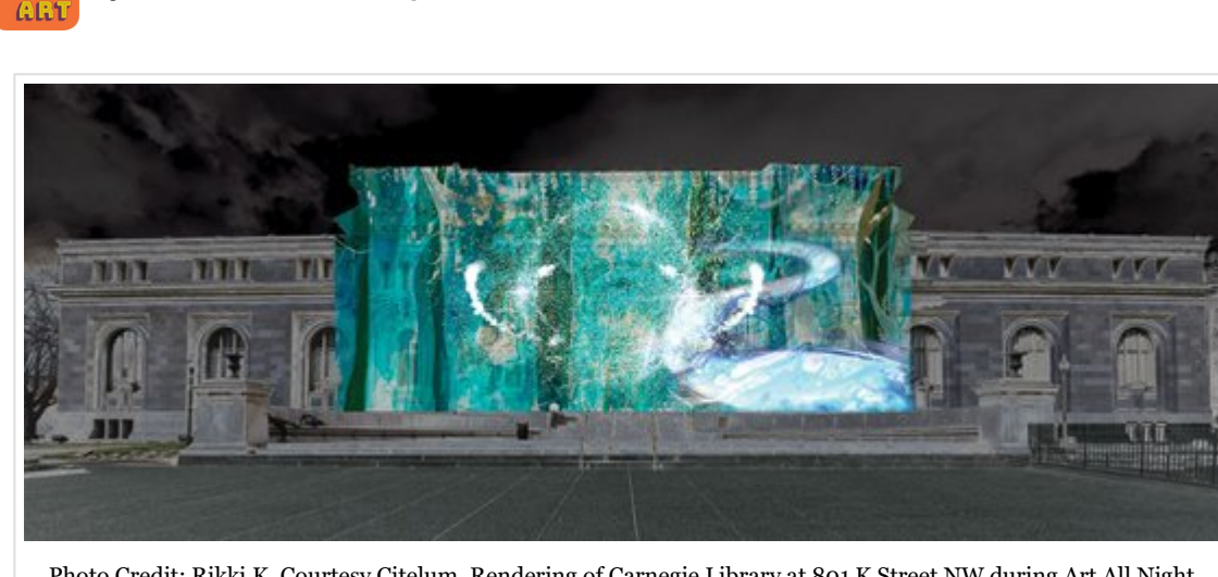
Rendering of Carnegie Library at 801 K Street NW during Art All Night