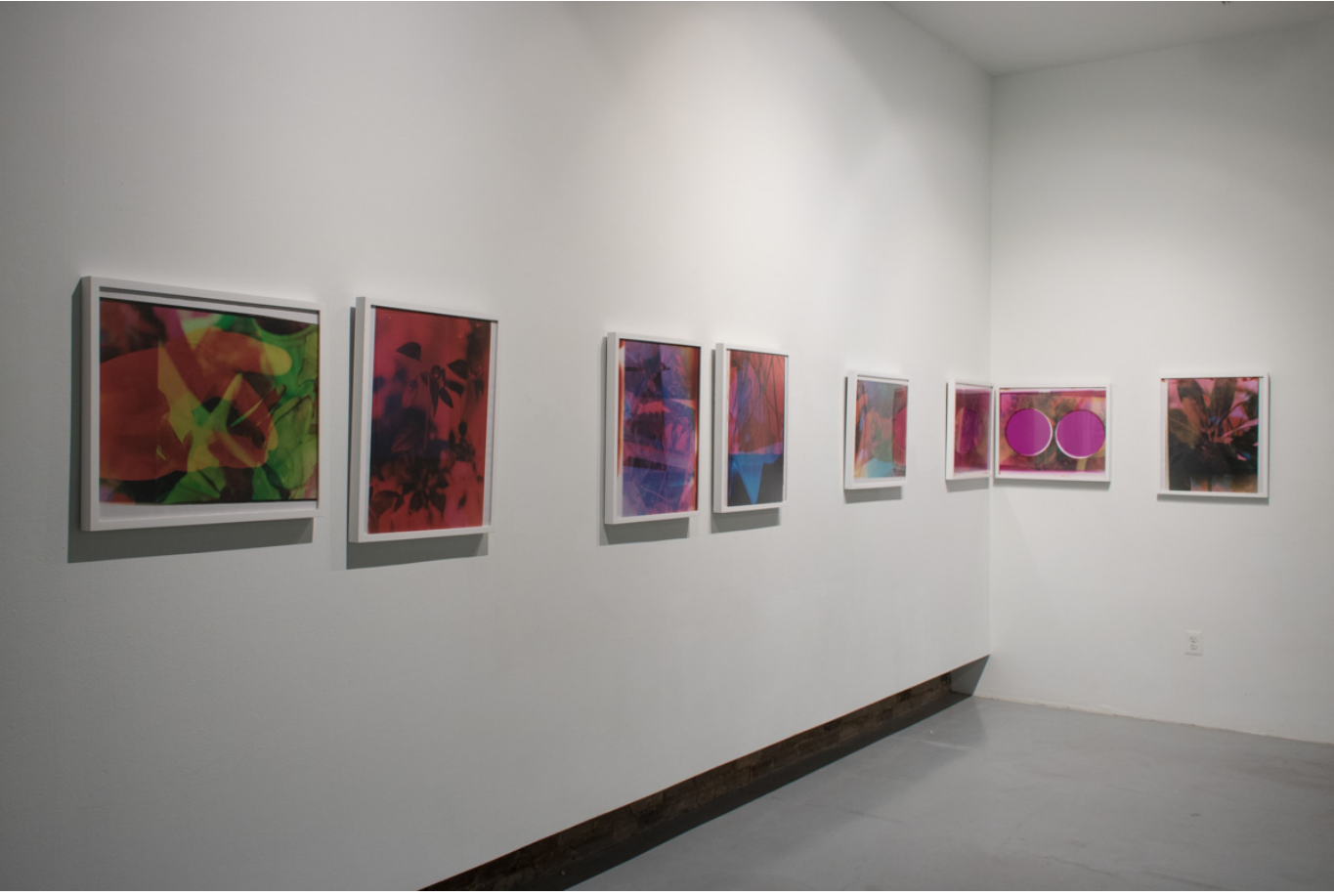
Rachel Guardiola. Archaeologies from VEGA's Garden . 2017. Unique chromogenic color print (darkroom print). 20 x 24 inches.