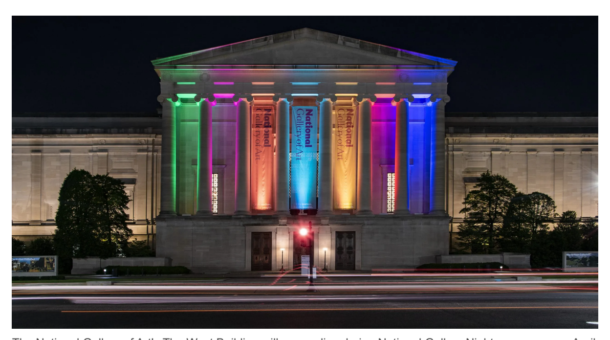
The National Gallery of Art's The West Building will come alive during National Gallery Nights programs on April 14, May 12, and May 9; Courtesy of NGA

Here are some arts-related headlines and news stories you may have missed in recent days. We're sending thoughts to Goonew's loved ones and fans while streaming Back From Hell . Check back weekly for future Monday Arts Roundups.